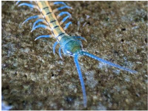
Image 1 - Image 2 - Image 3 - Image 4 - Image 5 - Image 6 - Image 7